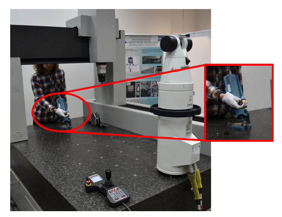
Fig. 2. The research station for form and diameter measurement – Laser Tracking system, reference sphere and its mounting system on CMM table

order to achieve this effect, it was decided that each point in the measurement task will be measured 100 times and then combined in groups so that the difference between the values of the RMS parameter for each of point in measuring task is as small as possible. The methodology described above was applied to both the distance measurement (2 points for measuring task) and the sphere measurement (5 points for measuring task). In the first case, combining the measurement points in a pairs was not a problem and the difference between the RMS parameter values fluctuated from 0 to 3 µm. In the second case, the set of points with the same RMS parameter increased to 5, which made the adjustment more difficult and the differences in the RMS parameter values varied between 0 and 8 µm.